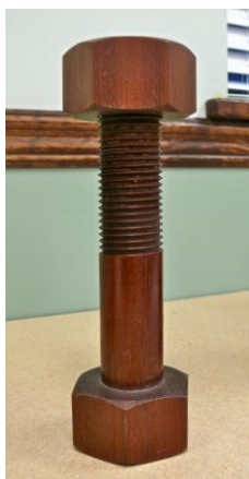
Figure 9 Unidentified nut