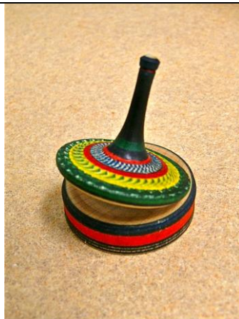
Figure 10 Gil Malave entry