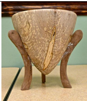
Figure 7 Maurice Cohen entry