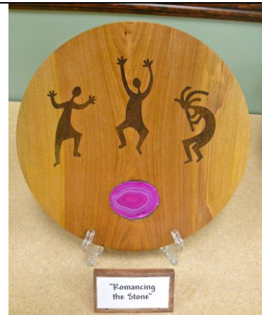
Figure 11 Wil Goldschmidt's "Romancing the Stone"