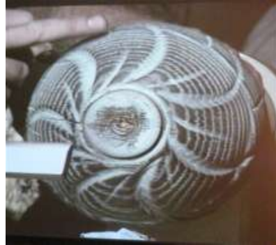
Beauty begins to appear