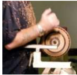
More turning and texturing