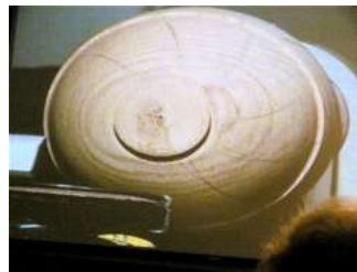
Pencil marks to guide carving after initial turning