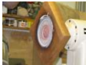
More stain and liming