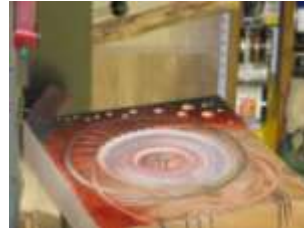
More features and staining included