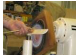
Evidence of multi axis