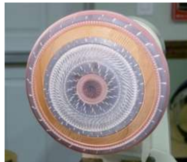
At the end of the day