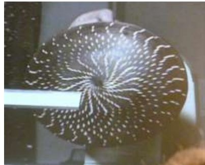
Arbotech cuts on a turning bowl