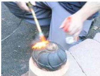
Propane torch for burning