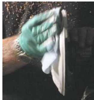
Wiping on more liming wax