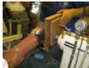
Multi axis turning set up