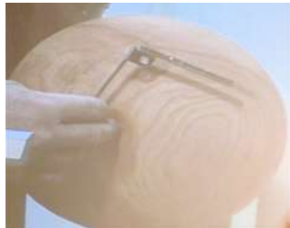
Tool for applying stain