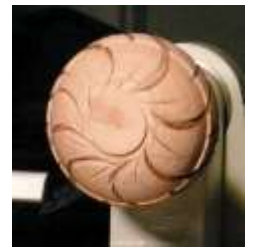
Grooves are cut