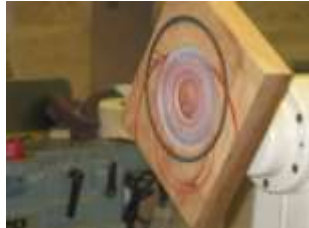
Surface was sanded and some grinding added