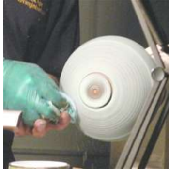
Hand buffing on lathe