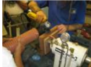
Continue pattern on to the side