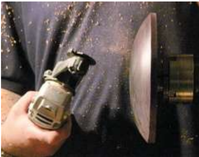
Arbotech type of cutter