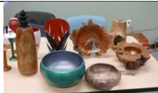
Air brushing with water based acrylics gives him more control than the customary spray cans.