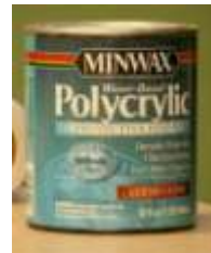
Water based polycrylic for clear coat.