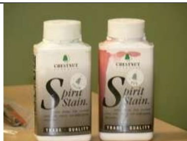
For staining he sometimes uses "Spirit Stains" and applies these with a brush.