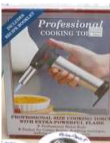
Just to make you hungry, he uses a crème brûlée torch for burning.