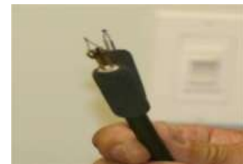
Burning hand piece