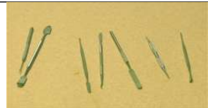
Dental tools are used to work with the fillers.