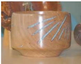
Inlase applied to the bowl