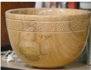
Textured with a dremel tool