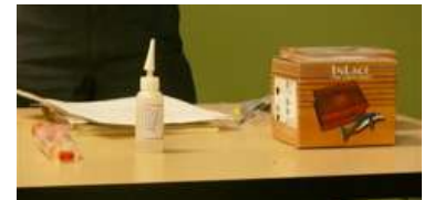
Epoxy, inlase and sawdust used for fillers