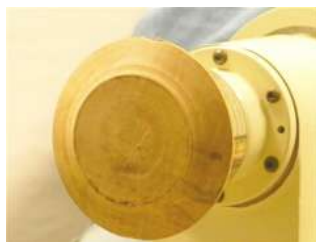
9. Fitting bottom tenon