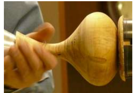
12. Almost done