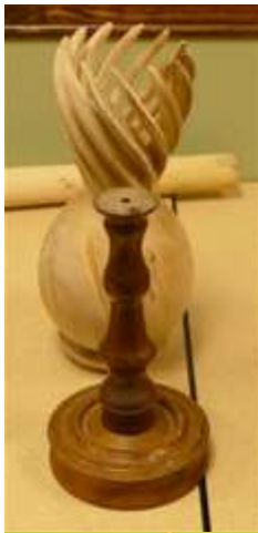
A sample of Dennis' work