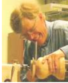
6. Coup de grace