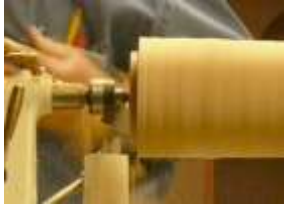
1. Cut 1 is done and turned