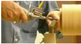
2. Drilling 1/2" center