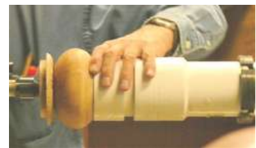
13. Jig to work bottom