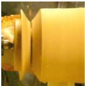
3. Cuts 4 and 5 partially done