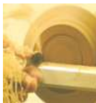
10. Working bottom mortise