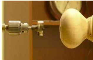
7, Forstner bit for cut 7