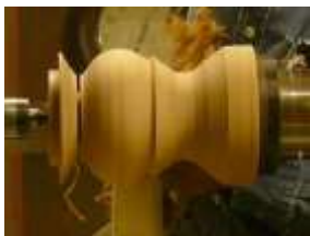
5. Working on cut 6