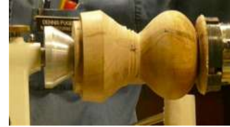
11. Set up to finish top