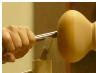
8. Working cuts 8, 9, 10