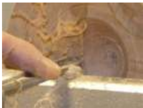
4. Some work on cut 3